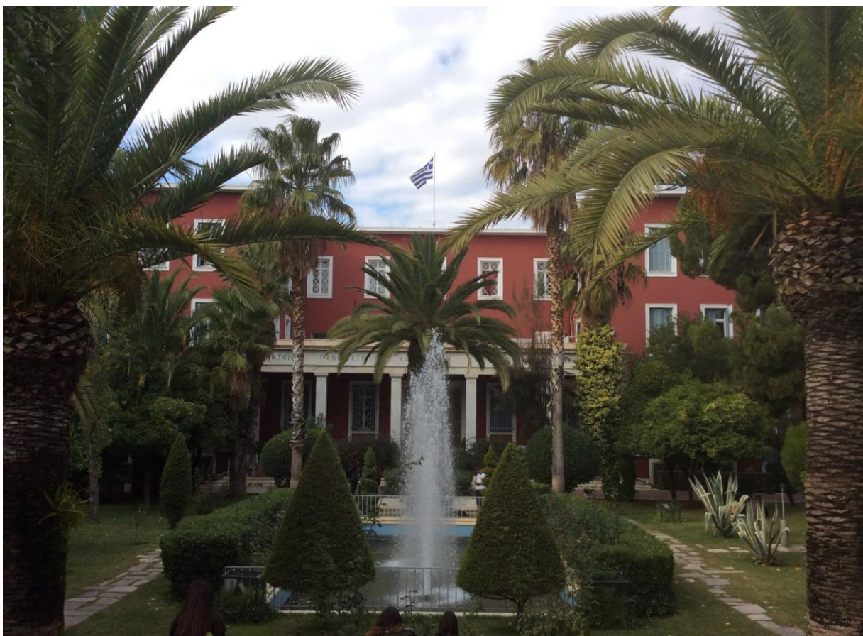
Panteion University of Social & Political Sciences